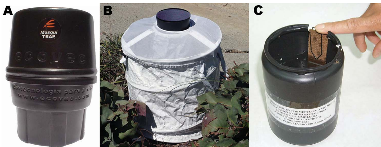
Figure 1. MosquiTRAP version 2.0 (Ecovec Ltd., Belo Horizonte, Brazil) (A), BG-Sentinel trap (Biogents, Regensburg, Germany) (B), and an ovitrap (C) used for obtaining mosquitoes in the northwestern borough of Belo Horizonte, Minas Gerais, Brazil.

pe, AZ, USA) with 1,000 bootstrap replicates. These sequences have been deposited in GenBank (accession nos. GQ330909, GQ330910, and GQ330911).